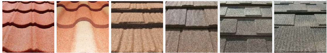
Tile Villa Tile Shake Shake XD® Shingle Shingle Plus